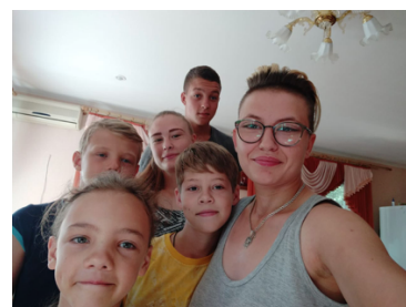
Selfie !Happy children